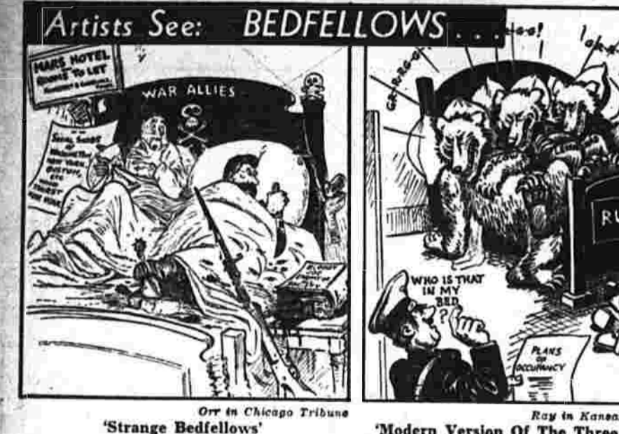
Artists See: BEDEFELLOWS